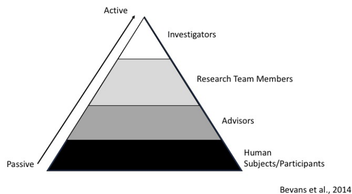
FIGURE 1. LEVELS OF ENGAGEMENT IN RESEARCH